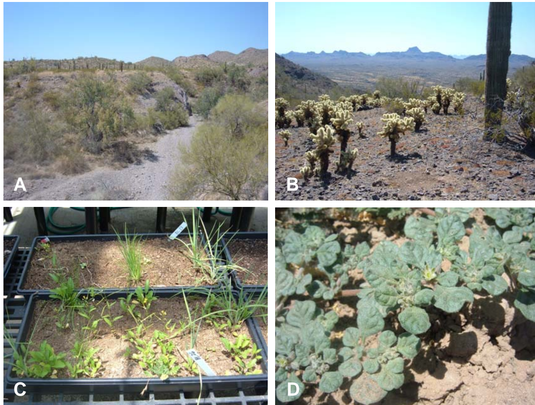
Vascular Flora of Hummingbird Springs. Figure 1. (A) Large wash in Hummbird Springs Wilderness representing Arizona Upland Sonoran Desertscrub with Paloverde, White Thorn Acacia and Creosote; (B) Large stand of Teddy Bear Cholla ( Cylindropuntia bigelovii ) with the Big Horn Mountains in the background; (C) Seedlings in Greenhouse Study; (D) Glinus radiatus in May 2007 at Dead Horse Tank.